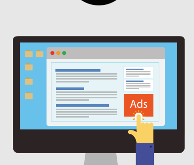
Your ads are served to potential customers on thousands of websites they visit in their normal online daily browsing.